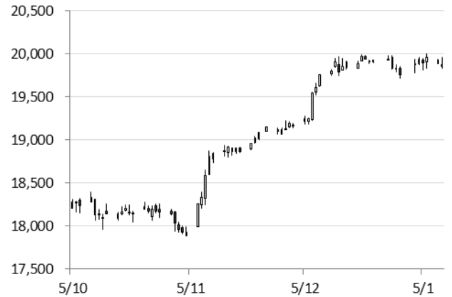
Dow Jones Industry Avg Index in last 3 months