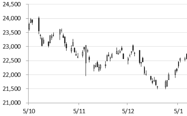
HSI performance in last 3 months