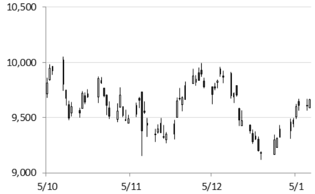
HSCE performance in last 3 months