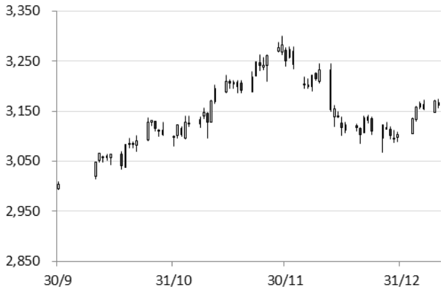
Shanghai Composite performance in last 3 months